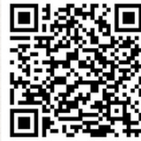
GoFundMe QR Code

Step 2 -Fill out your child(ren)'s information